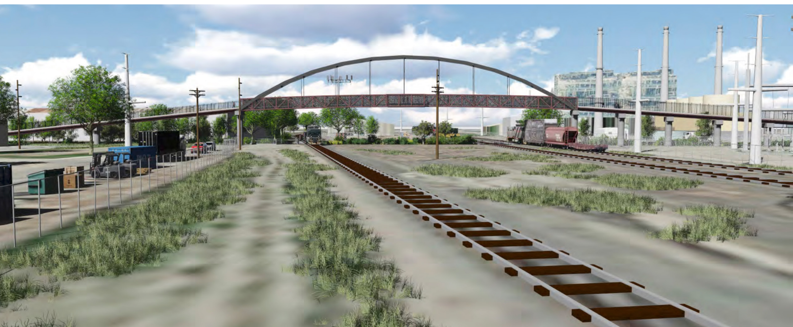
TUNABLE SINGLE SPAN BOX TRUSS BRIDGE WITH PAINTED STEEL