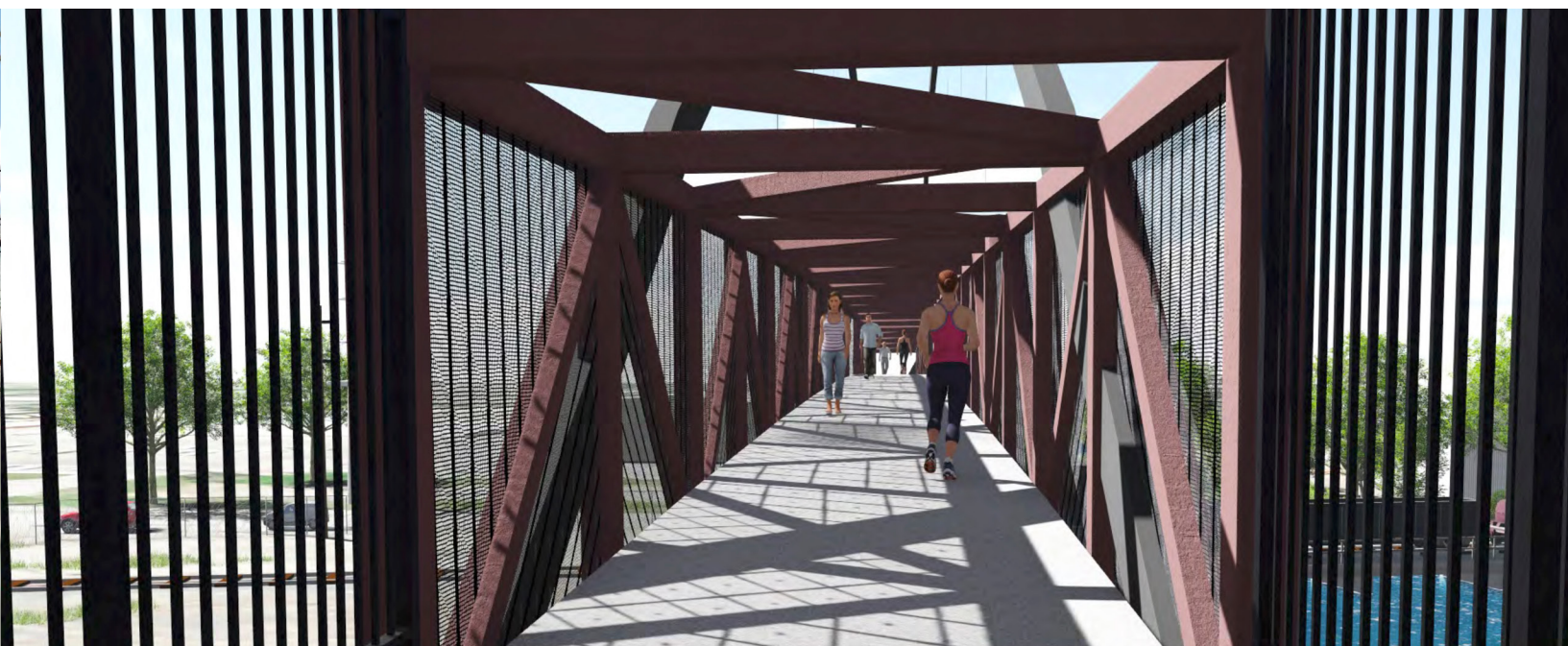
ADA DESIGN TO ACCOMMODATE ALL USERS