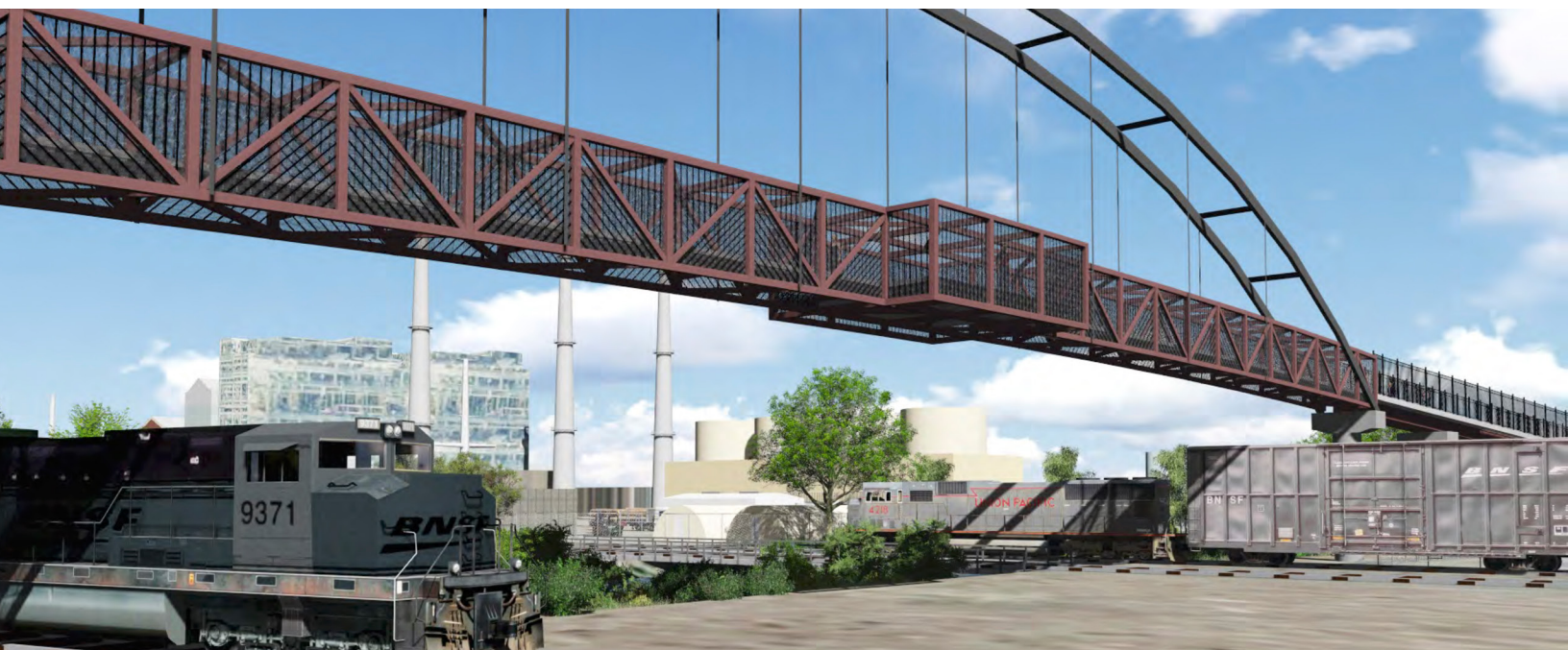
EAST AND WEST FACING VIEW AREAS LOCATED AT CENTER OF THE BRIDGE