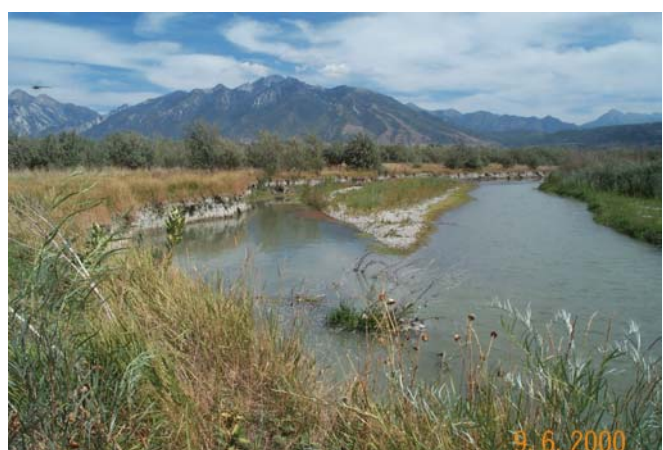
Before and after construction